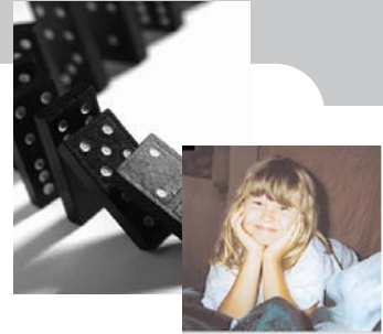
CFS, AGE 10